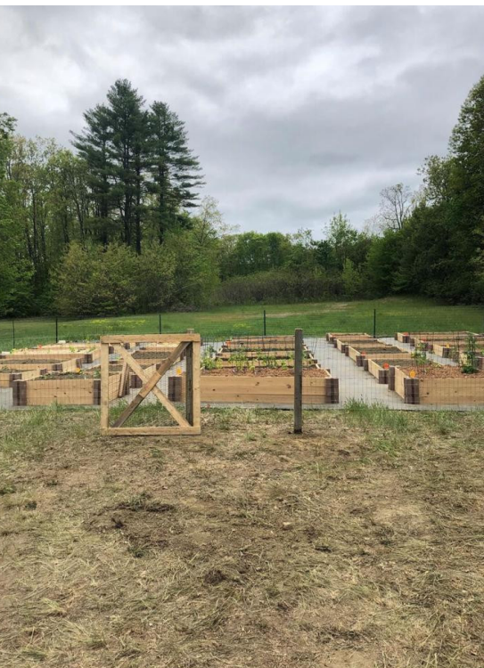
Charlestown Community Garden

Funded water source and 20 additional beds for the new community garden