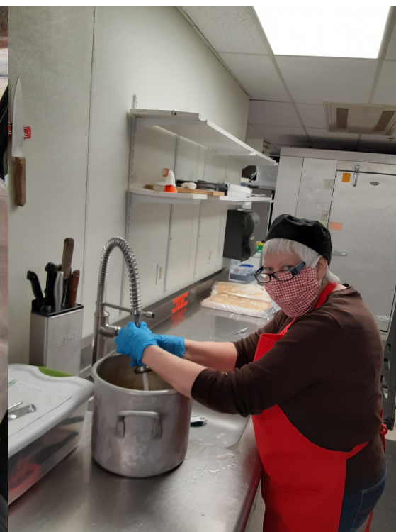
Claremont Senior Center

Funded costs due to operational losses that allowed them to continue meal programs for seniors