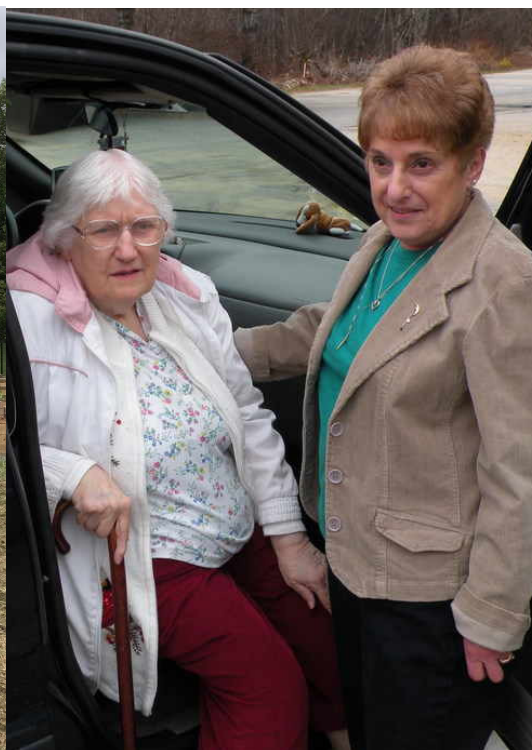
Kearsarge Council on Aging

Funded transportation and mileage for vulnerable seniors needing essentials