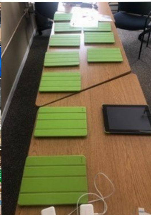
Funded for technology and increase telehealth capacity