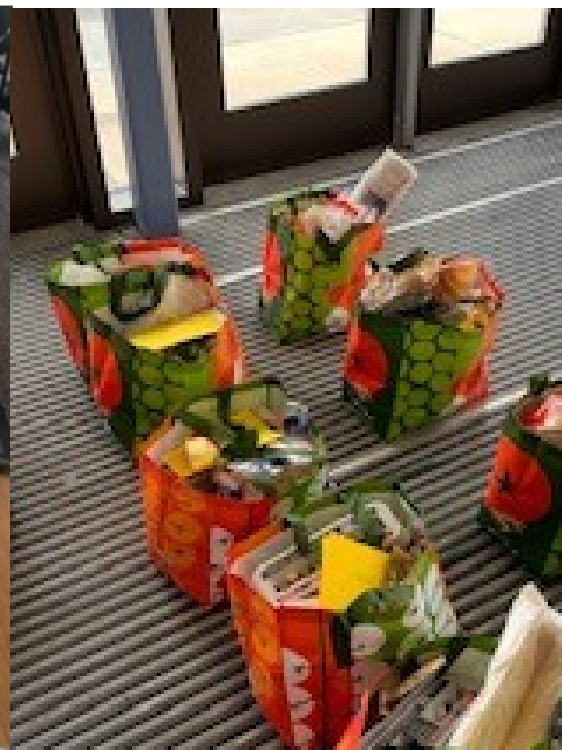
Funded additional food access for Kearsarge students on the weekends