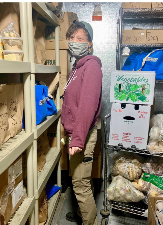
Funded additional cold storage for redistribution of food